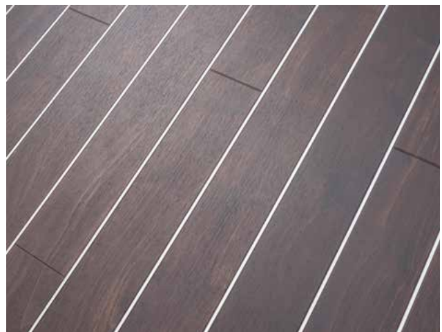
DESIGN FLOOR IN YACHT-STYLE