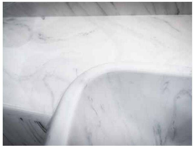
"ONYX BIANCO" MINERAL COMPOSITE IN THE BATHROOM (CENTURION ACTROS)