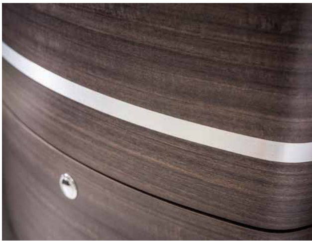
FURNITURE LINE IN ATLAS CEDAR WITH SUNKEN STAINLESS STEEL PILASTER STRIPS ON THE FRONT OF THE FURNITURE

An amazing feeling of space. The "Atlas Cedar" Rotondo furniture line with sunken stainless steel pilaster strips captivates with its emphatically emotional design language. Surfaces made of high-quality mineral composite with the "Carrara Bianco" colour scheme in the kitchen and the "Onyx Bianco" colour scheme in the bathroom impress with their silky-matt appearance. The abrasion-resistant "Amtico" floor in yacht-style with silver joints makes for excellent walking comfort and accentuates the stainless steel pilaster strips of the furniture.